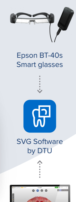
Sistema CAD per l'impronta digitale